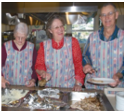
Turkey Day at the Center

For more local news, pick up the Pacific City Sun for free throughout South Tillamook County as well as at select locations in Tillamook, Lincoln City, Depoe Bay & Newport.