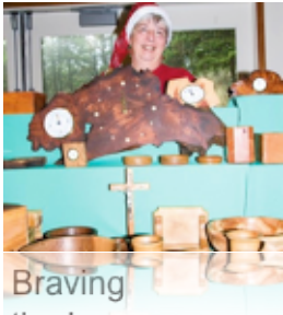
Braving the bazaars